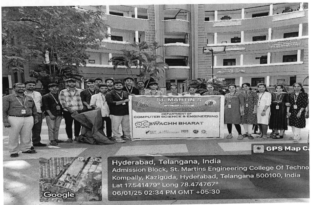
Students are created the awareness about Swachh Bharat